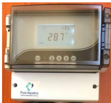
PA ORP Controller ORP-CONT-DCVF

The machine is supplied with a "Molex" plug and link which can be used as an interlock or remote on/off control. An ORP or DO3 monitor/controller with a potential free contact may be used to control the ozonation around a setpoint.