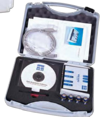
Data Hub for infrared data transfer

Ideal solution for simple, accurate COD measurements