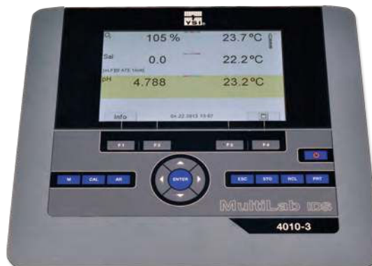
MultiLab 4010-3 Three channel

The YSI MultiLab line includes the 4010-1 (single channel), 4010-2 (dual channel) and 4010-3 (three channel) instruments providing easy-to-use and -calibrate menu-driven operation ideal for the laboratory.