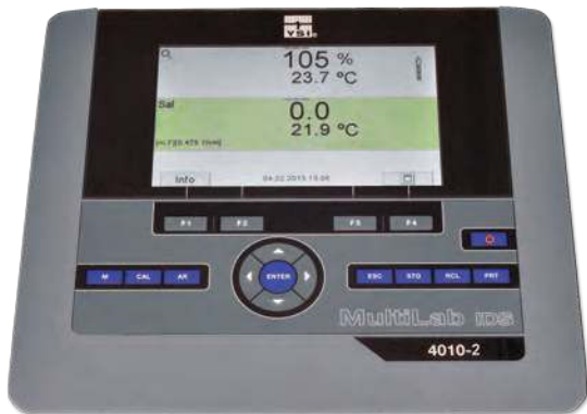
MultiLab 4010-2 Dual channel