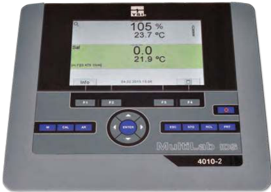
MultiLab 4010-2 Dual channel